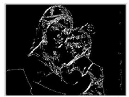
Fig: 2 Proposed Edge Detection

The comparison of proposed edge detection with of edge detection to sobel or prewitt edge detection. Black pixel indicates that this pixel is common for proposed and sobel/prewitt. Red pixel indicates that this pixel is only for sobel/prewitt. And blue pixel indicates that this pixel is only for proposed.