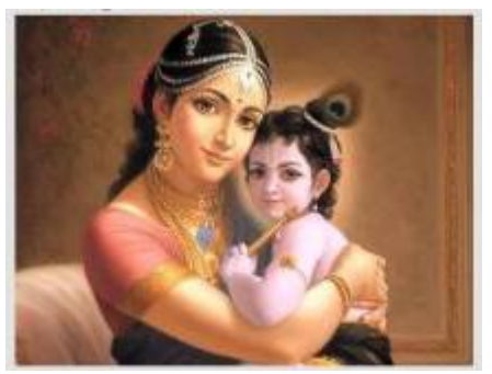
Fig: 1 Image for Edge detection