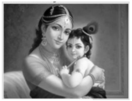
Fig: 2 Image after Advanced Filters