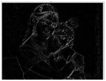
Fig: 3 Sobel Edge Detector